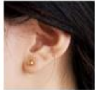
Small plain single stud in ear lobe