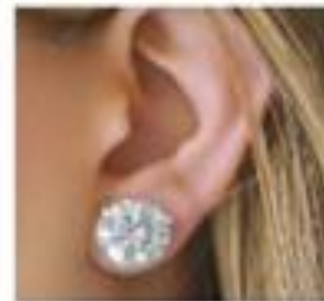
Large crystal studs