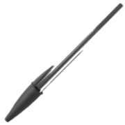
X2 Black Pens