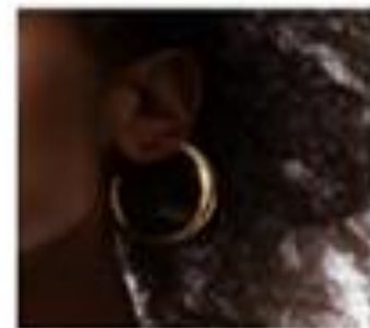
Hoops or dangly earrings